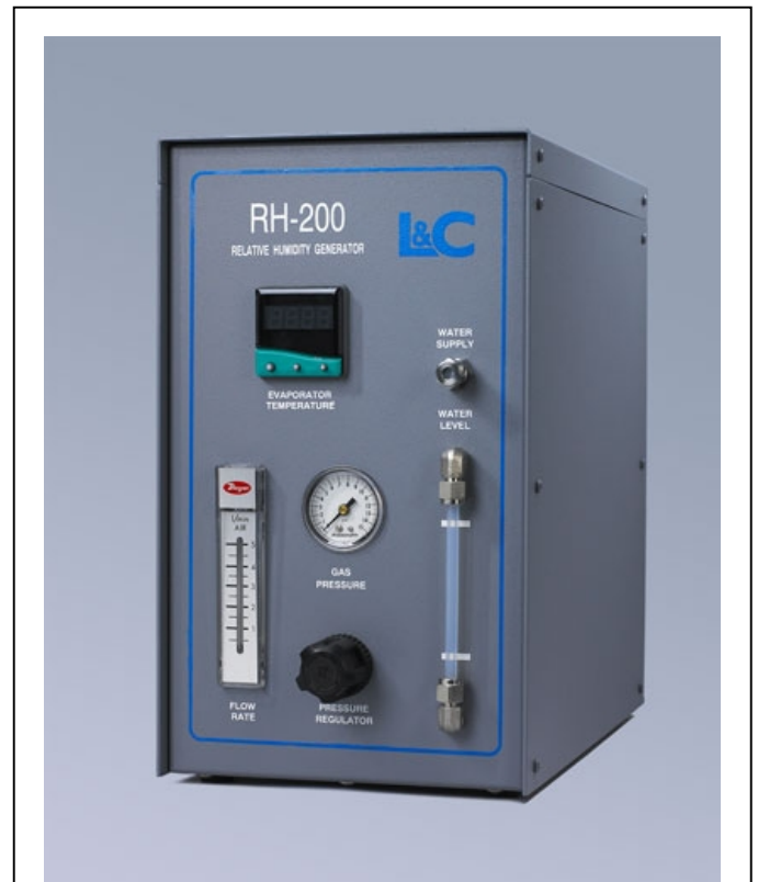
RH-200 Bench-Top Generator with footprint 8" wide by 14" deep.